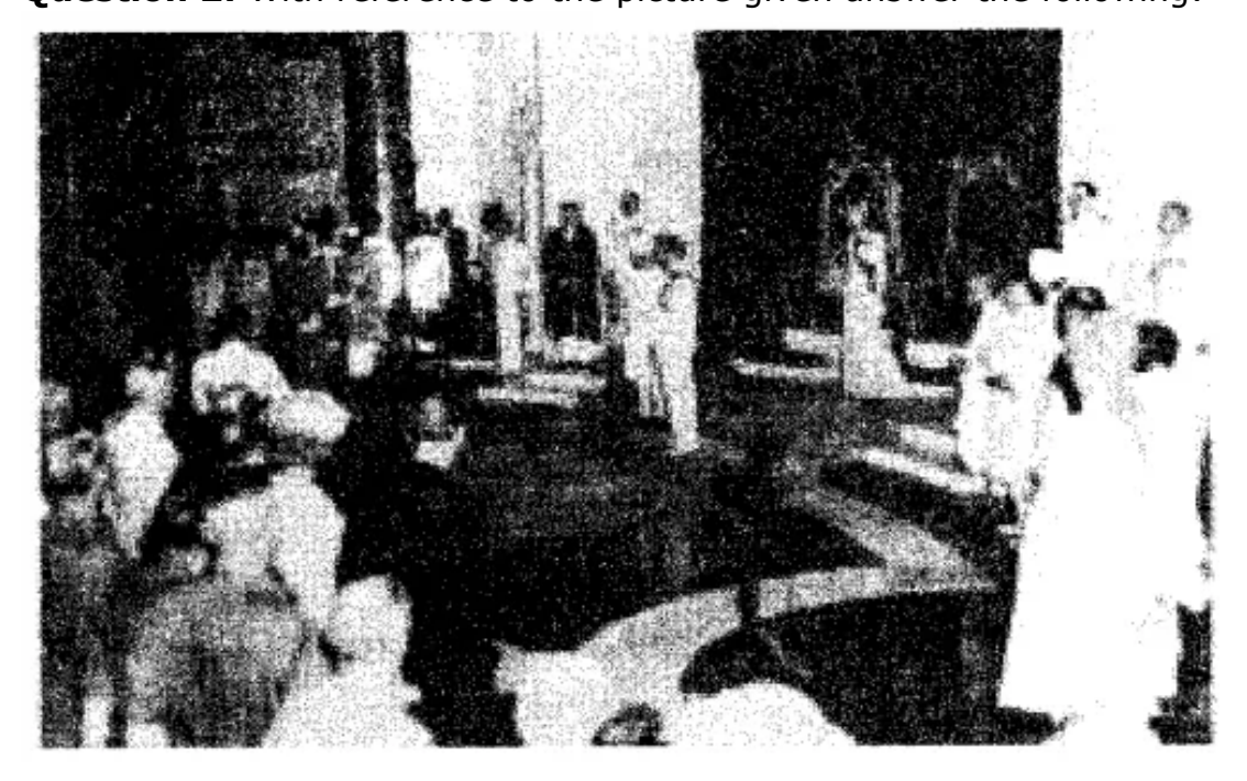
Question 2: With reference to the picture given answer the following:

(ii) Lord Clement Atlee sent Lord Mountbatten as the Viceroy of India to resolve the communal violence in India. He was given powers to negotiate with the leaders of different communities and help the two major parties, that is, the Indian National Congress and The Muslim League, reach an agreement.