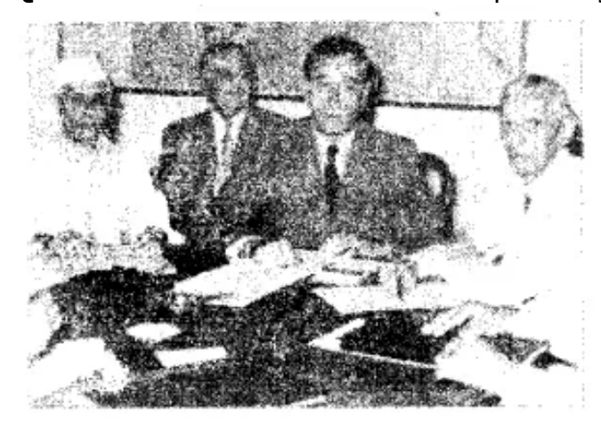
Question 1: With reference to the picture given answer the following: